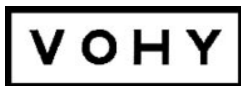
Figure 1 Glasgow acuity cards. Each has four letters per line and controls contour interaction by means of a surrounding crowding bar (after McGraw and Winn 6 ).

The SGT is a development of the original Stycar test. 19 It was originally designed for research into visual defects with physically and mentally handicapped children and, in addi-