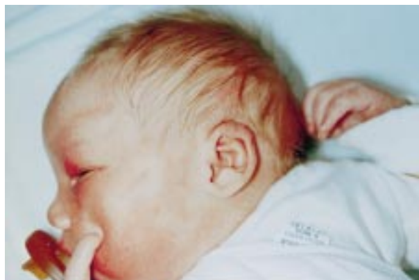
Figure 3 Photograph of baby with oculocutaneous albinism 3. Note brown colour of hair, a characteristic of this type of albinism. OCA 3 has only been reported in black patients.

In OCA 1, the gene mutation affects tyrosinase and, in OCA 2, the mutation affects the gene for P protein. OCA 3 is caused by a defect in tyrosine related protein 1 (TRP-1). 21 TRP-1 is the product of the brown locus in the mouse. A mutant allele in the mouse at that position causes the fur to be brown rather than black. 22 The human gene coding for TRP-1 is on the short arm of chromosome 9 (9p23). 23 The phenotypic features of OCA 3 in black patients are light brown hair, light brown skin, blue/brown irides, nystagmus, and diminished visual acuity (Fig 3). OCA 3 has not been detected in white or Asian races, perhaps because the phenotype may not be obvious. It is autosomal recessive. Although the function of TRP-1 in human melanogenesis is not fully determined, it acts as a regulatory protein in the production of black melanin. Its