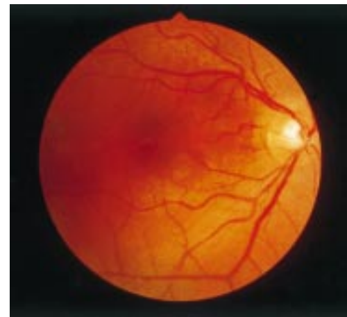
Figure 3 Left fundus photograph of carrier female from family 9 with RP3 showing mild retinal pigment epithelial changes.

In all 14 families, at least one carrier female was examined and in 10 families, more than one female was examined to give a total of 37 potential female carrier patients. Genetic testing indicated that 33 of those examined were likely to be XLRP carriers. The tapetal reflex was found to be present in carrier females from six of these families. One family with the reflex was RP2 (Fig 2A) and five were RP3 (Fig 2B). Of those carriers where no tap-