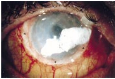
Figure 2 External photograph of case 3, 3 weeks after amniotic membrane transplantation. Arrowheads indicate the edge of the amniotic membrane posterior to the limbus. There is a dense white opacity on the membrane, which was related to ciprofloxacin treatment.

Patient No 10 (category C) had a successful ocular surface reconstruction, with the return of satisfactory mucosal appearance and release of adhesions (Table 1). Epithelialisation was rapid, and the resulting conjunctival surface remained stable 18 months after surgery, without inflammation or erosion.