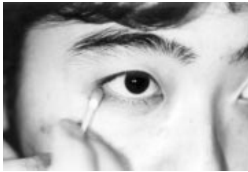
Figure 1 Application of calcium ointment to the lower lid using a cotton tip applicator.