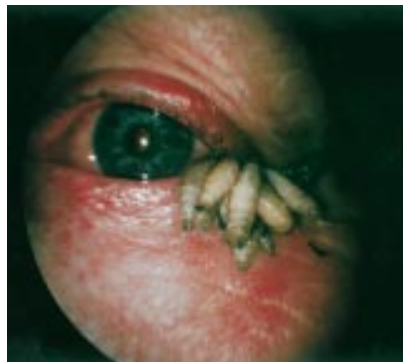
Figure 1 Fish hook loaded with nine live maggots embedded in the left upper eyelid.

left upper eyelid. He had cut off the line but made no attempt to remove the hook. The fish hook had pierced the eyelid from its conjunctival aspect near the outer canthus. It was loaded with nine live maggots that were used as bait (Fig 1). The left eye showed a small superficial linear abrasion of the cornea but was otherwise unremarkable and the visual acuity was 6/6. Under local anaesthesia after removal of the maggots, the hook was rotated so that the barb emerged through the eyelid skin. The barb was snipped off using a wire cutter and the hook was rotated back and removed. The patient was treated with saline irrigation of the conjunctival sac and a topical antibiotic and he made an uneventful recovery.