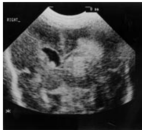
Figure 3 Coronal ultrasound scan with grade 4 intraventricular haemorrhage (IVH).

Of the 179 neonates screened 121 had no ROP, 22 had stage 1, eight had stage 2, and 28