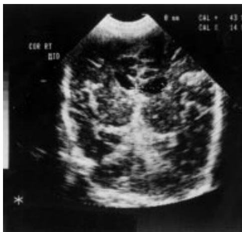
Figure 1 Coronal ultrasound scan demonstrating an intermediate grade 1/grade 2 intraventricular haemorrhage (IVH).