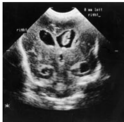
Figure 2 Coronal ultrasound scan with grade 3 intraventricular haemorrhage (IVH).

included babies with a birth weight of less than 1501 g or a gestational age of 31 weeks or less. Threshold ROP defined as stage 3 ROP in zone 1 or 2, involving 5 contiguous clock hours or 8 cumulative clock hours in the presence of plus disease was indication for treatment and was present in 11.1% of babies (21 infants).