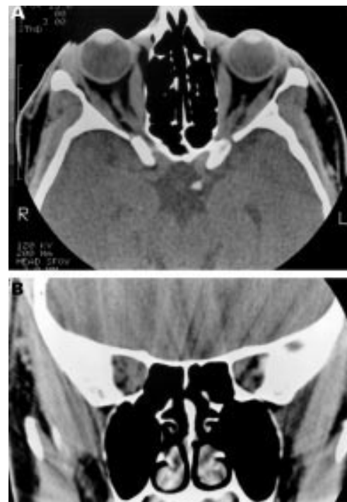
Figure 3 Preoperative axial (A) and coronal (B) CT scan of patient 3. Note bilateral enlargement of medial, inferior, and superior recti.

Three days postoperatively, colour vision improved to 9 of 12 Ishihara plates. Two weeks