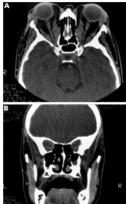
Figure 4 Preoperative axial (A) and coronal (B) CT scan of patient 5. Note bilateral enlargement of all rectus muscles with straightening of the optic nerve shadow and crowding of the orbital apices bilaterally.

Bone decompression was considered but rejected by the patient. Bilateral fat decompression was performed. Over the following 5 weeks, prednisone was discontinued and visual function improved. Visual acuity (20/20 right eye, 20/25 left eye), colour perception (12/12 in both eyes), and pupil reactions have remained stable over the subsequent year and the field defect has nearly resolved. Hertel measurements are 22 mm right eye and 23 mm left eye.