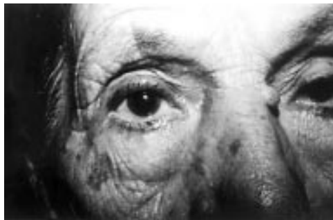
Figure 3 Follow up visit, with good positioning of the eyelid margin.

We defined surgical success as the disappearance of symptoms and good positioning of the eyelid margin, on apposition to the globe in