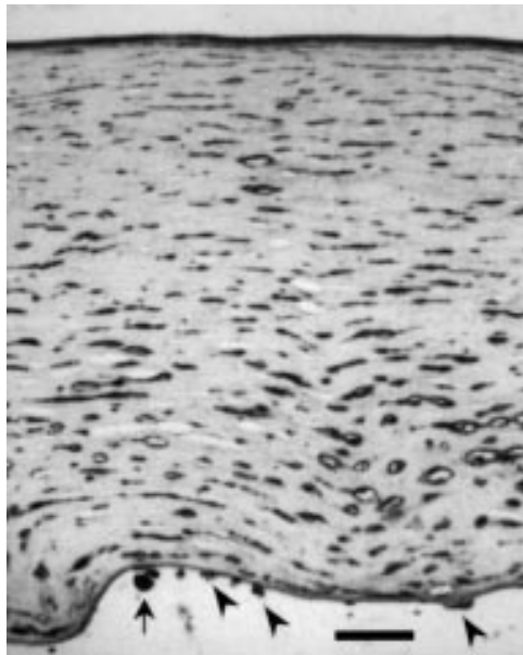
Figure 1 Case 1. The cornea is devoid of epithelium and the posterior surface is bowed as a result of oedema. Virtually all keratocytes are strongly positive for HSV-1, as are the remaining endothelial cells (arrowheads). Bowman's layer and Descemet's membrane are diffusely positive, possibly reflecting viral load in this tissue. A pigment-containing phagocyte (arrow) is present on the posterior surface of the cornea. (Immunohistochemistry, anti-HSV-1, DAB with haematoxylin counterstain. Scale bar = 100 \mu m).