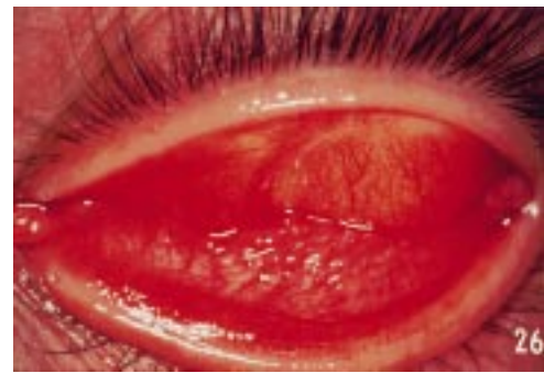
Figure 3 Moderate case of herpes simplex virus conjunctivitis. A 28 year old man, 3 days after the onset. Conjunctival follicles and hyperaemia are evident on the lower palpebral conjunctiva.

Out of 23 cases, 19 (82.6%) complained of discharge, and 12 (52.2%), nine (39.1%), and seven (30.4%) complained of itching, sensation of foreign body, and lacrimation, respectively, in the affected eye during the early stage of the infection. Conjunctival hyperaemia was present in 23 eyes (88.5%). Corneal involvement, such as superficial punctate keratitis, occurred in eight patients (30.8%). None of the patients developed dendritic keratitis in the clinical course. Most cases showed mixed follicular and papillary conjunctivitis with an increasing haemorrhagic component with increasing clinical severity. Moderate conjuncti-