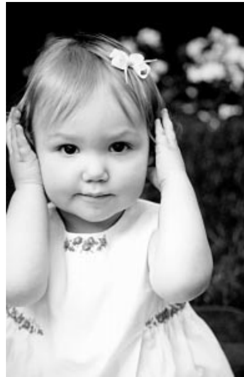
Figure 1 This is my patient who had a dense congenital cataract, left eye, identified at 1 day of age and had urgent surgery 48 hours after birth. The patient was treated aggressively with bilateral light occlusion from day 1 when the cataract was identified, until a contact lens was fitted at 1 week of age. The patient wears a contact lens full time, left eye, and the right eye is being patched 4 hours a day. As pictured above, the patient is now 1 year old, has excellent fixation in each eye, straight eyes, and the family is very happy that aggressive treatment was initiated.

When an older child presents with a unilateral cataract it can be difficult to know whether the cataract was there during the critical period and, if so, to what extent the cataract interfered with visual development. Often, the clinician is unsure whether it is worthwhile removing the cataract in a child who presents late after the critical period of visual development. Should we be aggressive in treating these children who present late with presumed unilateral congenital cataracts? This time the answer is sometimes. Kushner 13 reported relatively good results after surgery for monocular juvenile cataracts of undetermined onset. In the study of Wright et al 4 all patients presented after 10 months of age and were treated with lensectomy and aphakic contact lenses. Eighteen patients underwent surgery for a unilateral cataract and, of these, approximately 40% obtained a visual acuity of 20/60 or better. Unilateral cataracts having an especially good