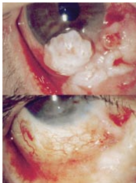
Figure 3 Pretreatment and post-treatment appearance of an extensive conjunctival squamous cell carcinoma with canalicular involvement following preoperative mitomycin C 0.04% eye drops, conservative excision of the main tumour nodule, and local intraoperative application of mitomycin C 0.4 mg/ml for 3.5 minutes. Definite regression of the lesion occurred over 6 months and a visual acuity of 6/6 was maintained in the treated eye.