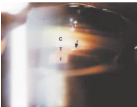
Figure 2 Gonioscopic view of the tube (arrow) emerging just anterior to the trabecular meshwork. C = cornea, T = trabecular meshwork, I = iris (9 months postoperative).