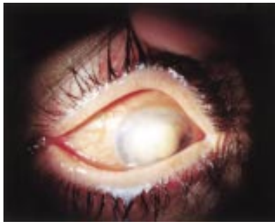
Figure 1 Left eye of 42 year old woman with invasive Fusarium solani keratitis/endophthalmitis after 8 weeks of maximal tolerated therapy with natamycin and amphotericin B.