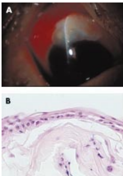
Figure 1 (A) Recurrent blebitis in case 1. Note the infiltrates inside the avascular, transparent bleb. (B) The histological study of the excised bleb from case 1 shows a one to two layered thin epithelium with goblet cell depletion and a poor inflammatory response (haematoxylin and eosin, original magnification, \times 150 )

Inflammatory reaction in the stroma of the bleb is decreased with the use of mitomycin C, 1,2,6-8 while cases of leaking blebs without antimetabolites reportedly show moderate subconjunctival inflammation. 3 Case 2 in the