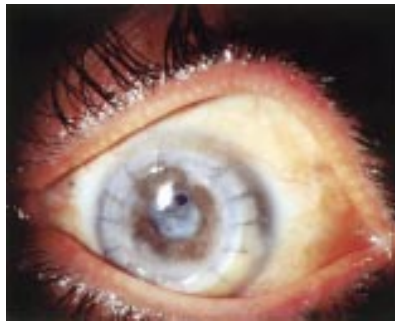
Figure 2 Eye shown in Figure 1 after successful treatment with topical and systemic posaconazole. Status post-penetrating keratoplasty and extracapsular cataract extraction with planned pseudophakia. The removed lens cortex contained fungal hyphae on histopathological assessment.

Fusarium solani . Initial therapy with tobramycin was followed by high dose topical hydroquinolones, whereafter the infection, continuing unabated, was construed to be fungal keratitis. High doses of amphotericin B both topical and intravenously, natamycin, and ketoconazole were administered, along with topical fortified cephalosporin, neosporin, and atropine. Despite these, the lesion spread to involve much of the corneal periphery (Fig 1), and repeat corneal cultures confirmed the presence of amphotericin B resistant Fusarium spp (MIC 24:48 hours in µg/ml: amphotericin B 2:2; natamycin 32:32; posaconazole 1:8).