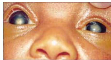
Figure 1 Bilateral dense infantile cataract. Early surgery is needed to avoid nystagmus and a lifetime of poor visual acuity.

A child becomes bilaterally blind every minute, primarily within developing nations. Of the 1.5 million blind children in the world, 1.3 million live in Asia and Africa, and 75% of all causes are preventable or curable. The prevalence of blindness varies according to the socioeconomic development of the country and the mortality rate of those under 5 years of age. In developing countries the rate of blindness can be as high as 1.5 per 1000 population. Compared to industrialised countries, this figure is 10 times higher. 1-9 Table 1 summarises some of the studies regarding prevalence of childhood blindness in various developing countries. 10-13 As reported by