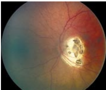
Figure 2 Same eye as in Figure 1 after five courses of TCT. Complete tumour regression with fibrotic remnants in the scar without optic nerve atrophy.