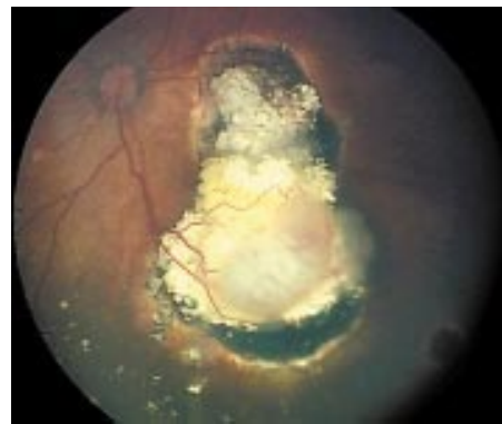
Figure 4 Finding 4 months after six courses of TCT (initial tumour height 5.7 mm). Typical occurrence of tumour relapse at the border and at the apex of the remnants with fish flesh regression. Additional ^{106} ruthenium brachytherapy achieved complete cottage cheese regression.

Recurrences at the margins of the tumour remnants were initially treated with laser coagulation in 17 cases. Brachytherapy with \beta ray plaques was performed in 14 tumours in 12 eyes. Indications for the latter therapy included massive