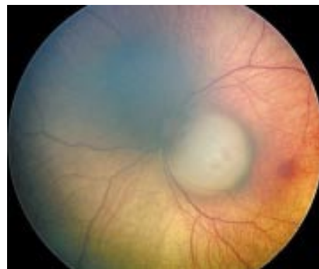
Figure 1 Hereditary juxtapapillary retinoblastoma with a tumour height of 2.4 mm and a diameter of 4.5 mm in a 3 week old girl. The tumour is beside the optic disc and fovea.

The complications induced by local laser treatment included transient corneal opacification in two eyes (6%), focal iris atrophy in three eyes (8.5%), and peripheral focal lens opacification in two eyes (6%). Complications in the posterior segment were a transient circumscribed retinal detachment in one eye (3%) and in one case a massive choroidal necrosis after the second course of thermochemotherapy (3%). There were no cases with clinically significant epiretinal gliosis, persistent occlusion of retinal vessels, vitreous haemorrhage, or the development of a vitreous seeding during or after TCT. The development of small haemorrhages within the tumour during thermochemotherapy was considered to be a treatment effect.