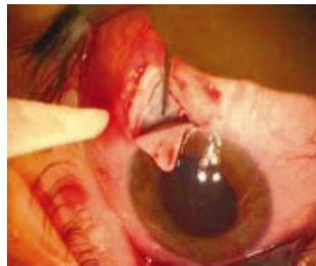
Figure 3 Intraoperative situs showing the SKGEL implant inside the scleral bed.

Postoperatively, the mean number of antiglaucoma medications was significantly reduced in both groups. However, there was no statistically significant difference between the two groups at each postoperative visit. At 12 months the mean number of antiglaucoma medications was 0.7 (SD 1.0) in the viscocanalostomy group and 0.6 (SD 1.0) in the VSRHAI group ( p=0.96 ) (Table 1). Compared to the baseline examination, the best corrected visual acuity and mean defect of visual field remained unchanged at the 12 month follow up visit in each group.