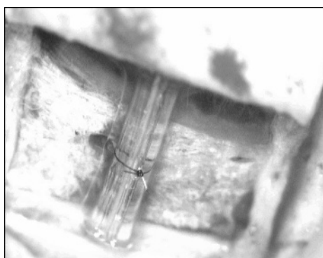
Figure 1 Photograph of collagen implant placed after deep sclerectomy dissection. SC was unroofed, anterior trabeculum and Descemet's membrane were exposed, and aqueous was seen filtering through the remaining membrane.

Statistical analyses were performed using SAS, Version 8.2.