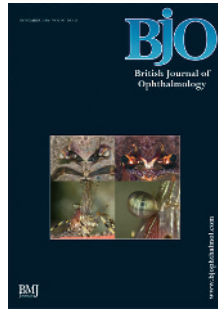
Tasmanian rock lobster and Spot Prawn

This journal is a member of and subscribes to the principles of the Committee on Publication Ethics