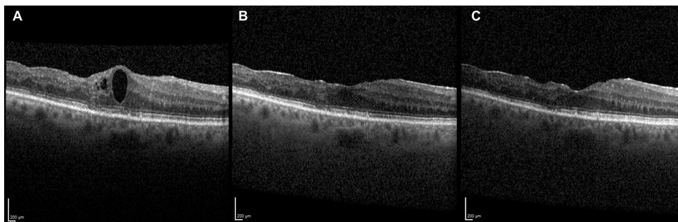
Figure 2 A 75-year-old woman with radiation maculopathy recalcitrant to high-dose intravitreal bevacizumab was treated with adjunctive intravitreal triamcinolone acetate. Resolution of macular oedema as demonstrated by optical coherence tomography at the time of initiation (A) was sustained after 12 months (B) and 18 months (C) of follow-up.