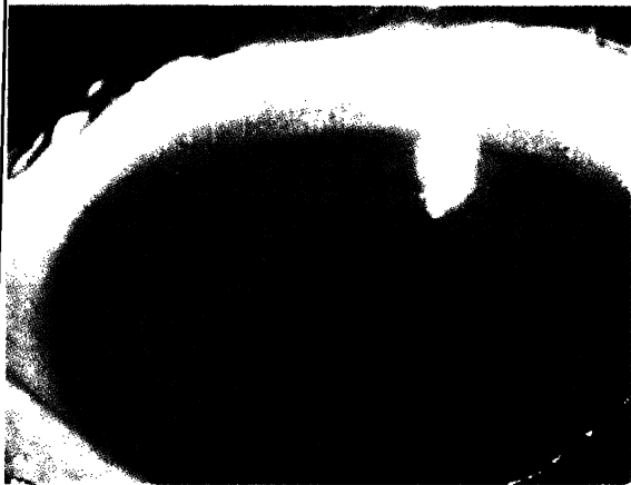
The opposite eye of the same patient treated with sodium cromoglycate drops. Before treatment, both eyes appeared similar.

Original text published in Clinical Allergy 1977; 2: 97 and reproduced by kind permission of the authors.