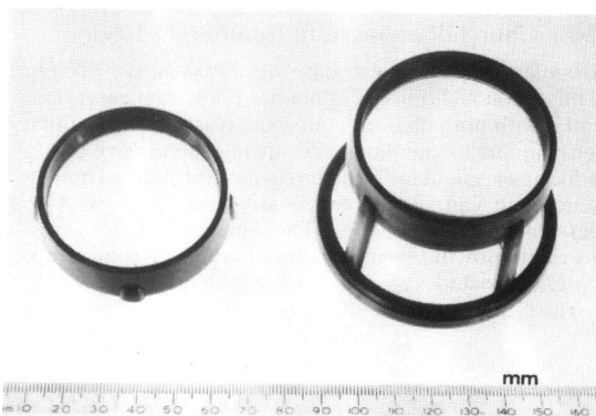
Fig. 1 Stand with legs removed.

90-dioptre aspheric lenses are extremely useful for examining the optic disc and macula, without the need for a contact lens, while the patient is sitting at the slit-lamp. Small lenses of approximately the same power are available