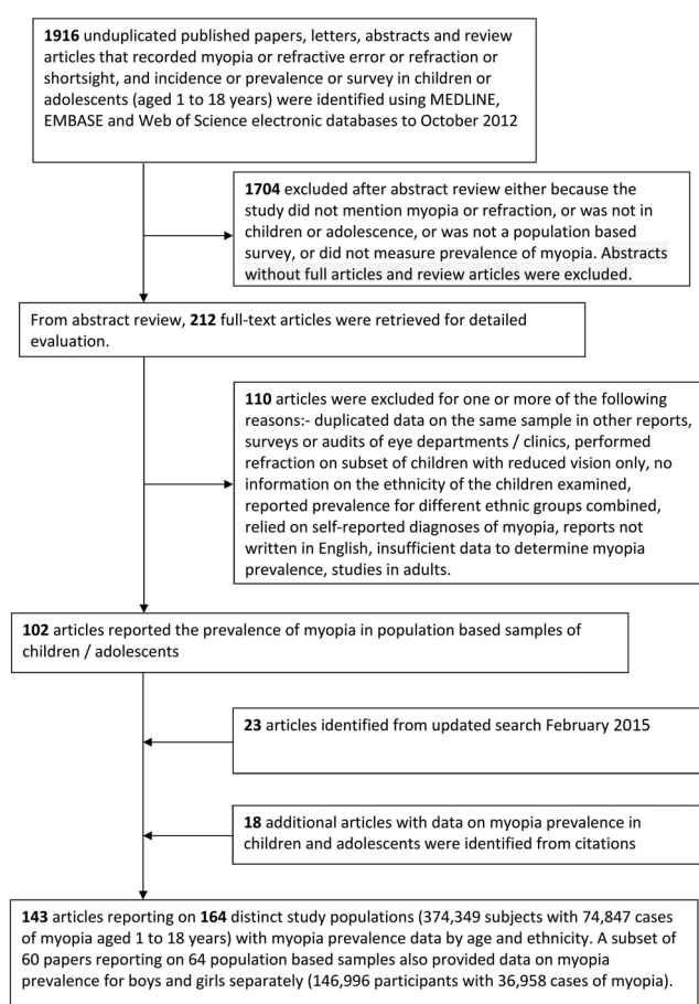
Figure 1 Summary of article selection process from MEDLINE, EMBASE and Web of Science.

Table 3 provides estimates of myopia prevalence by age and ethnicity standardised to children residing in urban environments. For whites, East Asians and South Asians estimates are