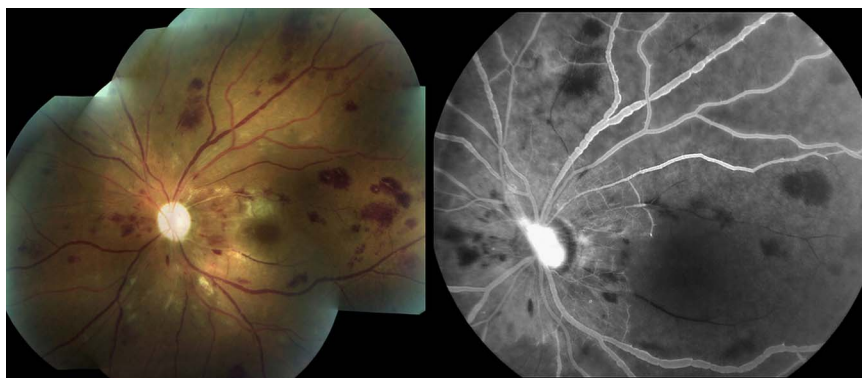
Figure 1 Fundus photograph (left) and fluorescein angiogram (right) of a 54-year-old woman who presented with acute severe vision loss in both eyes. Fundus photo (left) and angiogram (right) note extensive retinal capillary non-perfusion and macular ischaemia. Oral prednisone and anticoagulant were employed without steroid-sparing immunosuppressant. Final visual acuity was no light perception in 3 months later.

Modern imaging techniques including fundus fluorescein angiography (FFA), indocyanine green (ICG) and optical coherent tomography (OCT) have played an important role in the evaluation and monitoring of lupus retinopathy and choroidopathy.