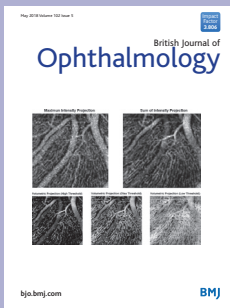
Cover image: Taken from Allegrini D, et al. Different kinds of planar reconstruction by z-axis projections of the decorrelation images. See page 612.