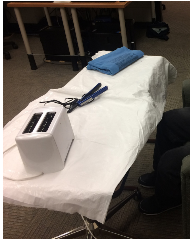
Figure 1 The set-up table for the experiments. A subject using his Argus II prosthesis was seated in front of a table covered with a white cloth to look for up to three heat-emitting objects. For task one, the subject was asked the number and the position(s) of the object(s). For task two, the subject was asked to discriminate a specific object out of the three presented.

Subjects used their artificial vision therapy system to complete the following study tasks: