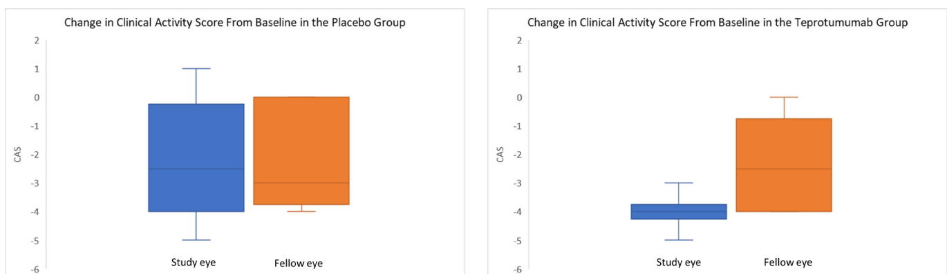
Figure 2 Change in clinical activity score from baseline to 24 weeks, in the treatment and placebo groups.

In the teprotumumab group, at baseline, all patients had diplopia. Following treatment, eight (80%) had an improvement in one or