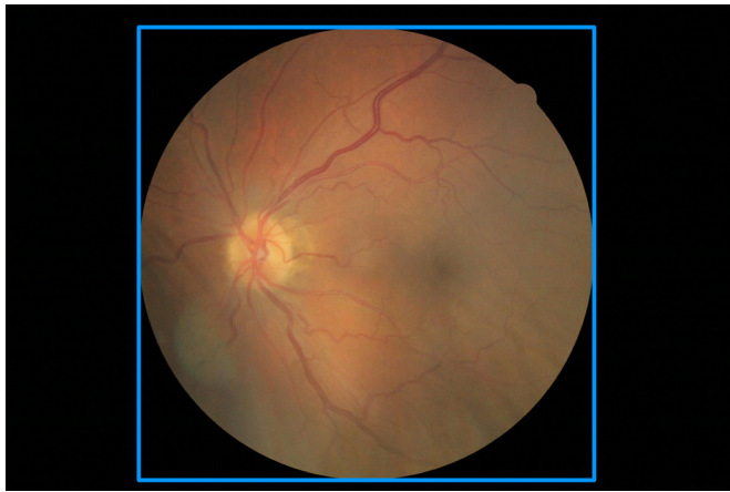
Figure 2 Example of image cropping, blue lines represent the cropping boundaries.

of 0.883 (95% CI 0.868 to 0.897), specificity of 0.880 (95% CI 0.864 to 0.894), and AUC of 0.950 (95% CI 0.943 to 0.956) were achieved. On the eye level, sensitivity of 0.925 (95% CI 0.900 to 0.945), specificity of 0.931 (95% CI 0.916 to 0.944), and AUC of 0.979 (95% CI 0.972 to 0.984) were achieved. On the patient level, sensitivity of 0.929 (95% CI 0.881 to 0.947), specificity of 0.926 (95% CI 0.911 to 0.944), and AUC of 0.981 (95% CI 0.971 to 0.987) were achieved.