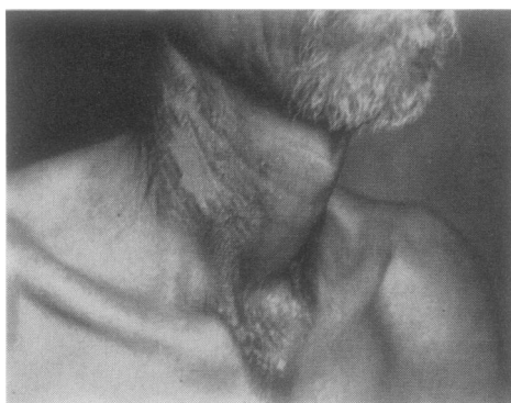
FIG. 1 Necklace type of dermatitis involving exposed parts of the skin

Pellagra is very common in the rural area of Udaipur, where maize is the staple diet. The condition is due to a deficiency of nicotinic acid in food, and is frequently part of a general malnutrition syndrome. Pellagra manifests as dermatitis, diarrhoea, and dementia; the typical dermatitis (Fig. 1) appears in the cooler months, and affects the exposed parts of the body when villagers bask in the sun. There may be brownish pigmentation of the skin of the eyelids, the lid margin, and the exposed part of the conjunctiva, limbus, corneal epithelium, and cortical and sub-cortical areas of the lens (Fig. 2).