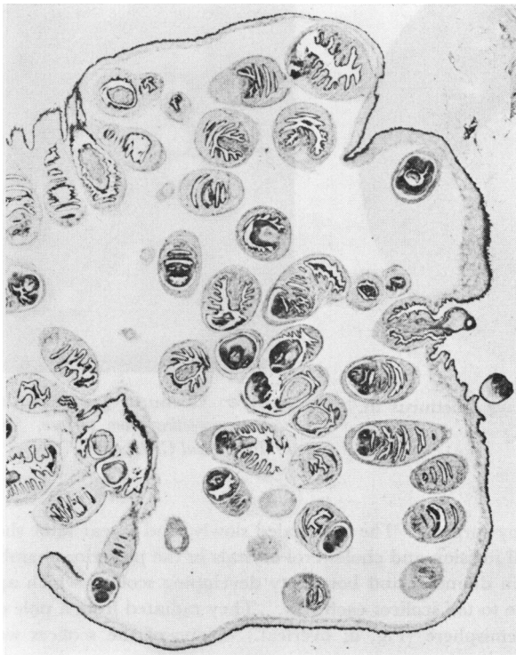
FIG. 3 Photomicrograph of Coenurus from Case 3, showing numerous scolices. \times 35

All five cases in which the cyst was located in the subconjunctival region occurred in children. All lived in the mountains which form the eastern wall of the Western Rift Valley at the border between Congo and Uganda. As such they show striking similarities to the Ugandan patients with subcutaneous disease who are often of a similar age and reside in the same part of the country. It is possible in view of the age of the patients that such cases result from inoculation of the larva directly into the conjunctiva or skin during early toddler life when the trunk and eyes are frequently close to the ground which may be contaminated. Removal of the cyst (Fig. 3) is seldom difficult and results in a complete cure.