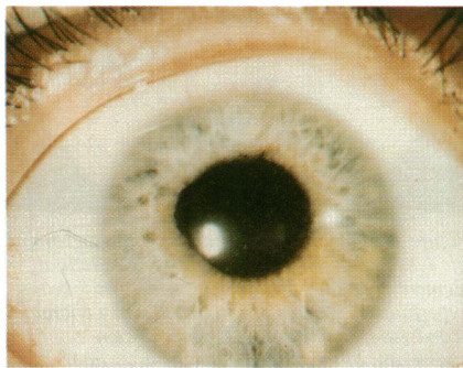
Figure 2 Slit-lamp photograph of the right iris showing iris crypts and mild persistent ectropion 3 months after radiotherapy. There is no residual iris thickening.

brown and the left iris blue. Ectropion uvea was present superiorly, but there was no iris neovascularisation or lens abnormality. The posterior segment examination was unremarkable. Systemic examination was normal. Uncomplicated fine needle aspiration biopsy of the solid mass was performed via a superior temporal approach. Cytological evaluation of the specimen showed the presence of large atypical lymphocytes, morphologically compatible with non-Hodgkin's lymphoma. Immunocytochemical studies revealed positive staining of the cells for CD20 (L26) (Fig 1: inset), a pan B cell marker, and negative staining for CD45RO (UCHL1), a pan T cell marker. The patient underwent anterior external beam radiotherapy to the right iris, receiving 1980 cGy in 11 equal fractions. Three months later, the visual acuity was 20/20 and there was no thickening of the iris in the right eye, although the iris was less mobile than the left and there was some persistent ectropion uvea of the pupillary margin (Fig 2).