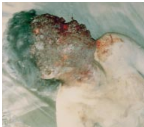
Figure 3 Charring of the skin is the hallmark of mine blast injuries.

Enucleation at an early stage was performed in ruptured eyes with no vision to prevent sympathetic ophthalmia in the other eye, a practice also in use at other centres. 30 Eviscerations in blind eyes were carried out with a provision for subsequent implant of a silicone ball prosthesis.