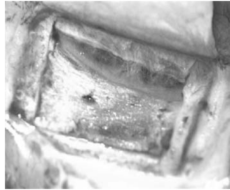
Figure 2 4x4 Deep scleral flap is dissected and excised unroofing Schlemm's canal.

when an eye required further glaucoma drainage surgery, developed phthisis bulbi, or lost light perception.