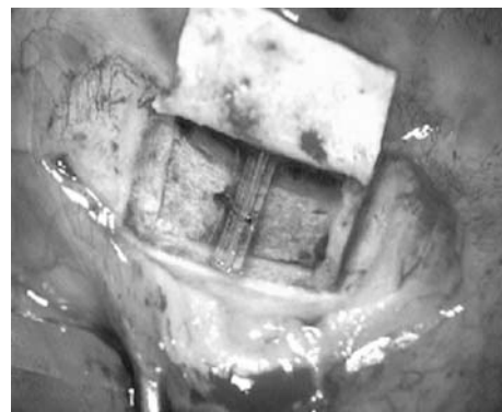
Figure 3 The collagen implant is sutured in the scleral bed.

Complete success rate, defined as IOP lower than 21 mm Hg without medication, was 34.6% (18/52 patients) at 48 months for the DS group, and 63.4% (33/52 patients)