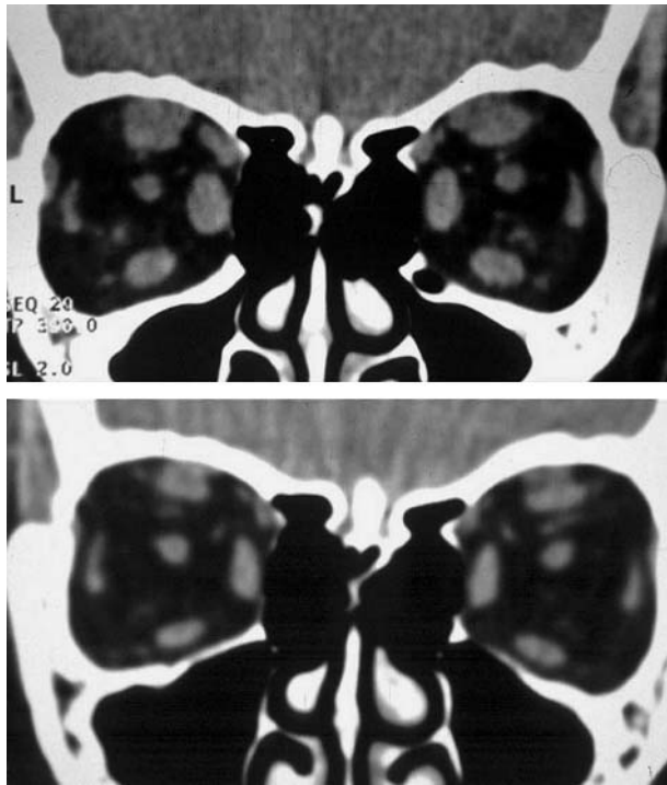
Figure 2 (A) CT scan coronal views of extraocular muscles in the treatment group patient before treatment. (B) CT scan coronal views of extraocular muscles of the same treatment group patient at week 24.

group absolute change mean (SD) was -11.1 (75.5) with a change of -1.91\% . Statistically significant differences were detected between groups ( p = 0.0122 ). Analysis of covariance for this population showed statistically