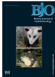
Didelphis virginiana and Trichosurus vulpecula

This journal is a member of and subscribes to the principles of the Committee on Publication Ethics