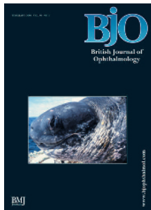
Leatherback marine turtle

www.publicationethics.org.uk This journal is a member of and subscribes to the principles of the Committee on Publication Ethics