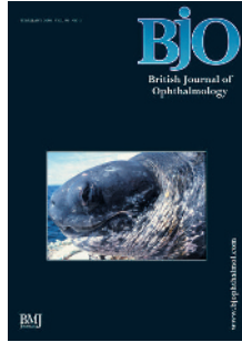
Leatherback marine turtle

This journal is a member of and subscribes to the principles of the Committee on Publication Ethics