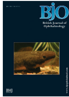
Lungfish, Neoceratodus fosteri

This journal is a member of and subscribes to the principles of the Committee on Publication Ethics