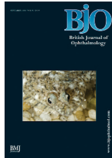
Sand dab, Citharychthys

This journal is a member of and subscribes to the principles of the Committee on Publication Ethics