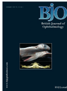
Scalloped hammerhead shark

This journal is a member of and subscribes to the principles of the Committee on Publication Ethics