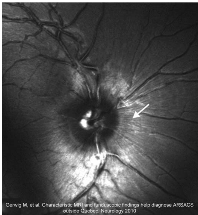
Figure 2 Examples of previously published funduscopy images from Spastic Ataxia of Charlevoix-Saguenay (ARSACS) patients that probably were mistakenly considered to show hypermyelinated retinal fibres. A complete neuro-ophthalmological examination including stereophotographs, retinal nerve fibre photographs and analysis with digital image analysis devices such as optical coherence tomography in these ARSACS patients may demonstrate that they present increased retinal nerve fibre layer density and thickness instead hypermyelinated retinal fibres.

linear striation at the pons; 5 6 ultrastructural observations do not corroborate the notion that hypermyelinated fibres constitute the basic pathophysiology of the retinal abnormalities in ARSACS patients; 4