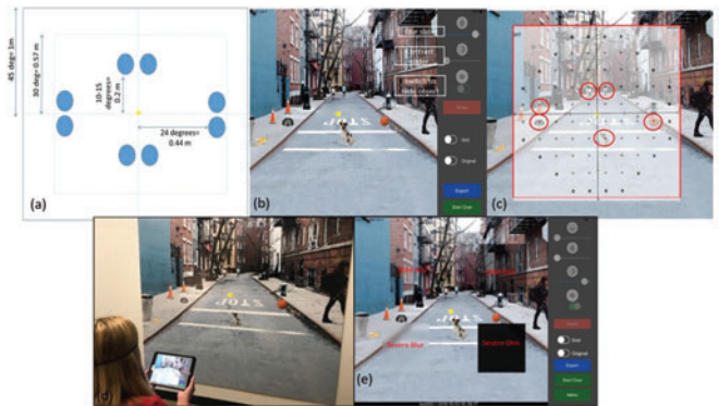
Figure 1 Building and administering the app. (A) Poster design: a 2x2 m poster subtending a visual angle of 45° at 1 m was designed depicting a naturalistic street scene with a central fixation point (yellow dot) and objects of interest placed at areas of common glaucomatous visual field defect (blue dots in 1a and red circles in 1c). The objects of interest subtended a visual angle of 5–7° at 1 m (10–12 cm on the poster) with good contrast from the surroundings. (B) Screenshot of iPad app: areas can be selected and modified using a sliding scale for blur and contrast. A toggle switch can be used to hide an object. (C) Analysis: the subject response at each point on the poster corresponding to the HVF loci was recorded as visualised in 1c. There were 54 loci tested monocularly for each HVF 24–2 and 56 loci for HVF 30–2 and for the binocular fields. (D) Subject compares poster with iPad image and modifies the iPad image until it matches their perception of the poster. (E) Screenshot of iPad app showing the varying degrees of blur and dimness adjusted by the sliders present on the right (*The topmost slider is an extra Colour slider included in the latest version of the app which was not used for this study). HVF, Humphrey visual fields.

App administration (figure 1D,E): an investigator masked to the subjects' visual field defects administered the study monocularly to the right eye, left eye and then binocularly in the same sequence. When testing monocularly, the other eye was covered with an eye patch. The subjects used their own bifocal refractive