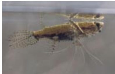
Figure 2 Side view of Pantodon .

retinas are directed simultaneously along independent optic axes. Cones in both retinas are directed towards the pupillary aperture to exploit the Stiles-Crawford effect of the first kind. This property permits each photoreceptor to maximise the wave guide optics effect of its anatomy. Cones in the ventral retina are narrower than those in the dorsal portion of the eye suggesting improved aerial acuity compared to aquatic acuity (Saidel WM, Phil Trans R Soc Lond B 2000;355:1177). This characteristic difference in cone size reflects an evolutionary adaptation within one portion of the retina to the different physical constraints of image formation in air and water.